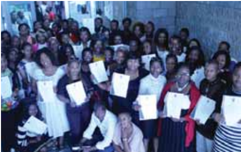
Eastern Cape e-literacy graduation in December 2015.