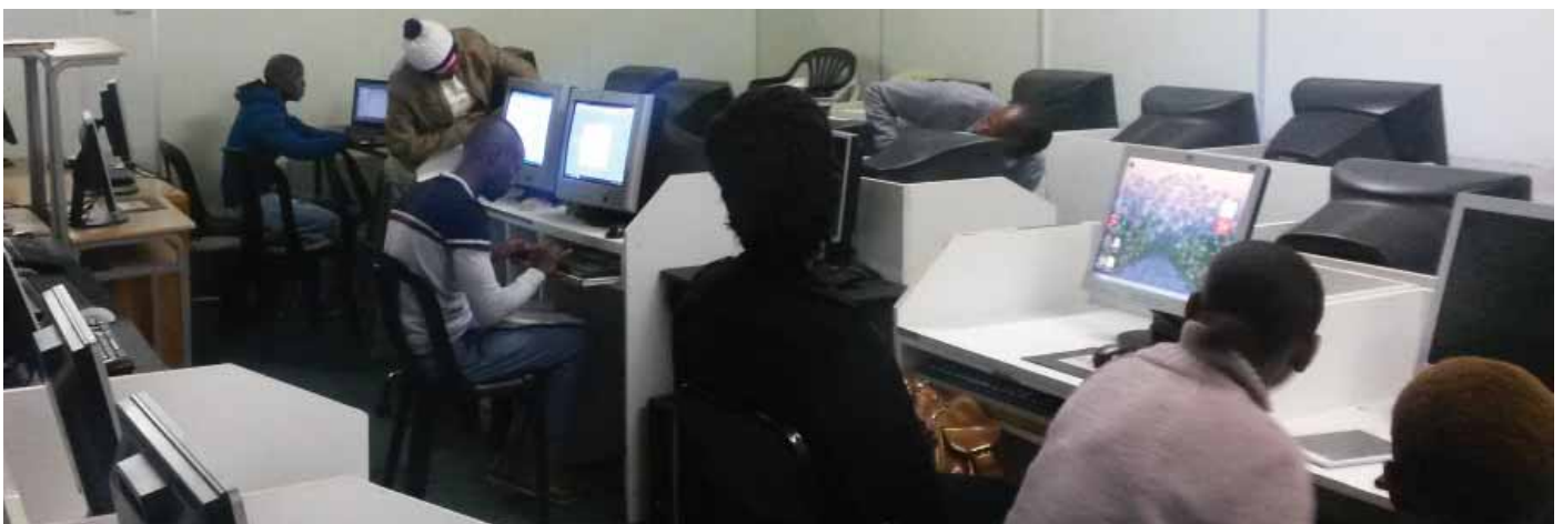
Participants at the Eastern Cape digital training.