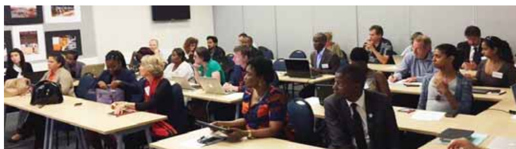
Participants at the 'S-DIRECT: Social Digital Innovation' seminar.