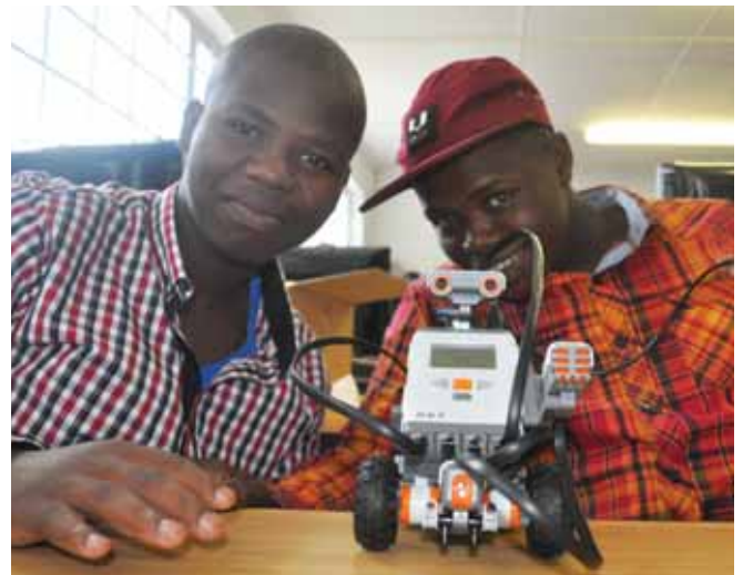
School pupils at the schools programming workshop.