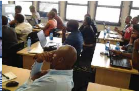
2015 Social Media Boot Camp in East London.