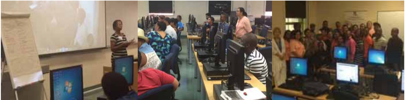
Trainers and participants at the five-day e-centre manager training course in the Western Cape.

e-Centres have a critical role to play in the e-skilling of communities. Developing digital literacy (e-skills) is essential for citizens to take advantage of ICTs, broadband and government e-services. Part of e-skills is understanding and being aware of the benefit of ICTs.