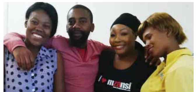
Trainers and participants at the Northern Cape digital training.