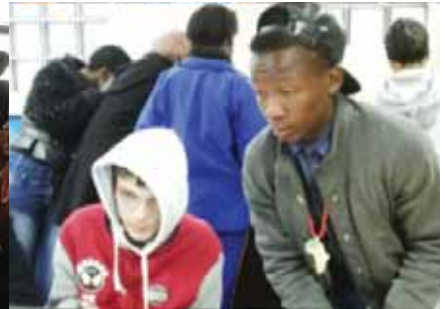
2015 school programming workshop

training for stimulating the EC agriculture sector through the use of ICT. The CoLab hopes to make a significant contribution to each of these components.