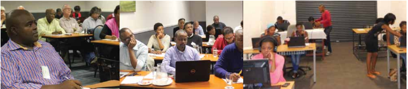
'ICT and Agriculture: Realising the Development Dividend' 2015 seminar.