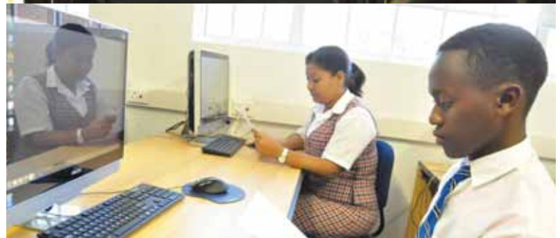
School pupils at the schools programming workshop.